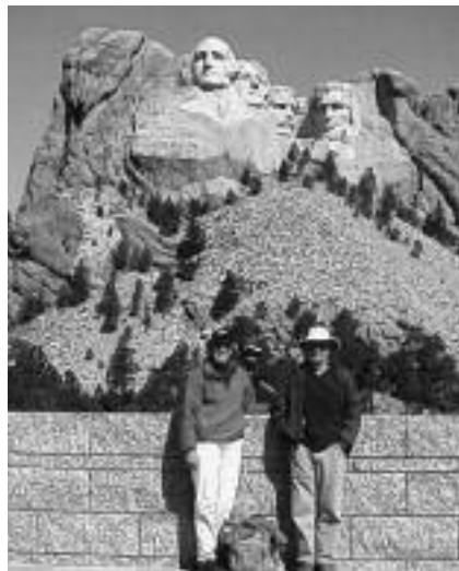
Being dwarfed by Mount Rushmore.

We departed from Sausalito the day after the Issaquah Dock Art show in April. Our route took us through Nevada,