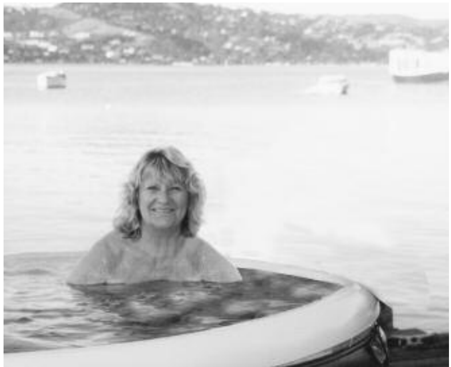
The Bare Essentials.