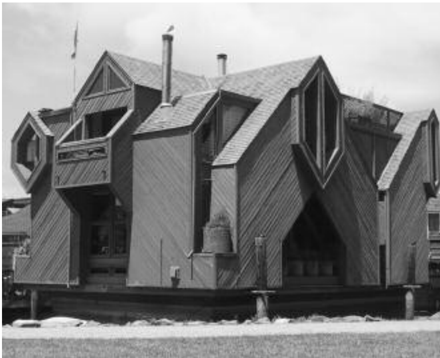
First time on the tour is the stunning home at 1 Kappas East.