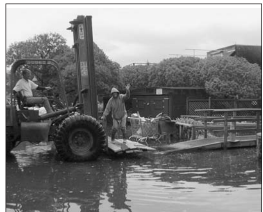
During the first storm of the year, waters rose above Issaquah's temporary ramp, so Muriel Kifer had to be fork-lifted to shore.

FHA members can save $10 off the regular price of the Marin Express 2003 discount program, which offers two-for-one dining at over 140 restaurants, plus savings up to 50% at over 700 local merchants. You can order the Marin Express program for yourself or as gifts for others by sending a check for $20 each to the FHA, PO Box 3054, Sausalito, CA 94966, or by calling 331-3999. Be sure to provide your address and phone number, along with the exact quantity.