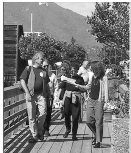
Happy visitors strolled Kappas West.