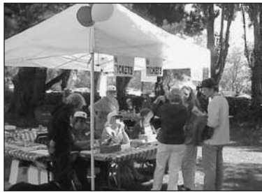
The registration tent was busy all day with walkup traffic.