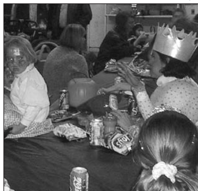
Halloween revelers enjoyed a BBQ at the fire station that kicked off the fundraising campaign for a new fireboat.

The little dog, whose name was "Joey" according to his tag, was shivering and sad-looking. I paddled us back to my home and brought him in. My cat Sailor was very curious but shared her food and water. I looked at his tag and called the phone number on it. A lady answered and was very excited to hear that I had her dog. It seems she and her husband had been visiting some friends on Liberty Dock the