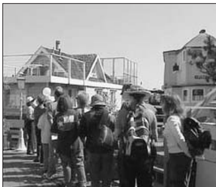
Crowds lined up to see the Pirate on Issaquah Dock.

I intend to continue writing for the Floating Times, and I'm willing to help someone transition into this position. There's a good team of volunteers in place, and more could be recruited in order to spread out the workload. If you're interested, contact me at 332-6196 or at click@dipsymusic.com . Someone must step forward now in order for this publication to continue.