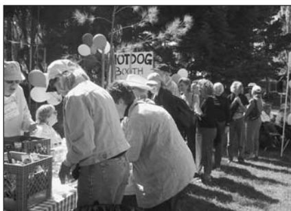
Hot dogs sold like – well – hot dogs.