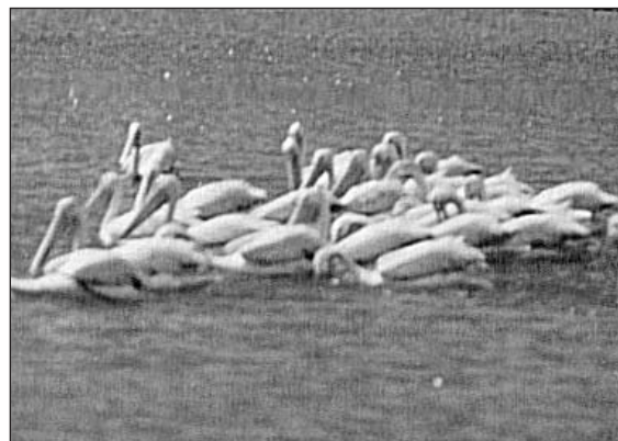
A rare colony of white pelicans visited Kappas Marina for several days this fall.